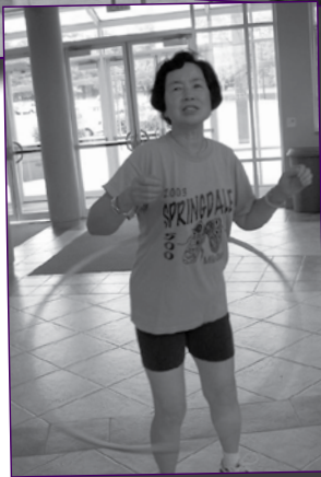
Summer Survivor Challenge