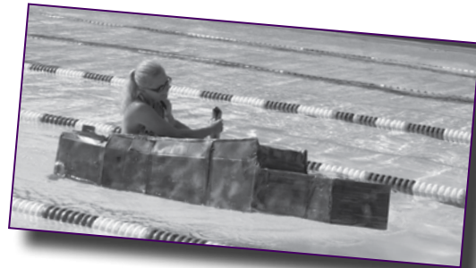
Cardboard Boat Regatta