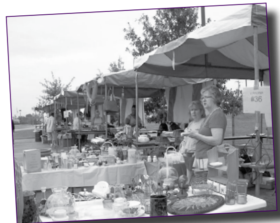
Great Deals at the Yard Sale